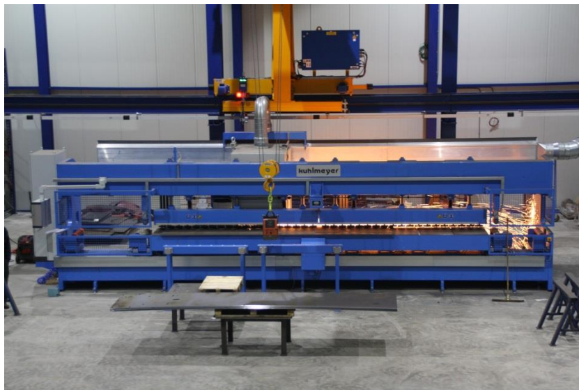
Kuhlmeier UKF 3.1-6000 at van Zanten / Veenendaal